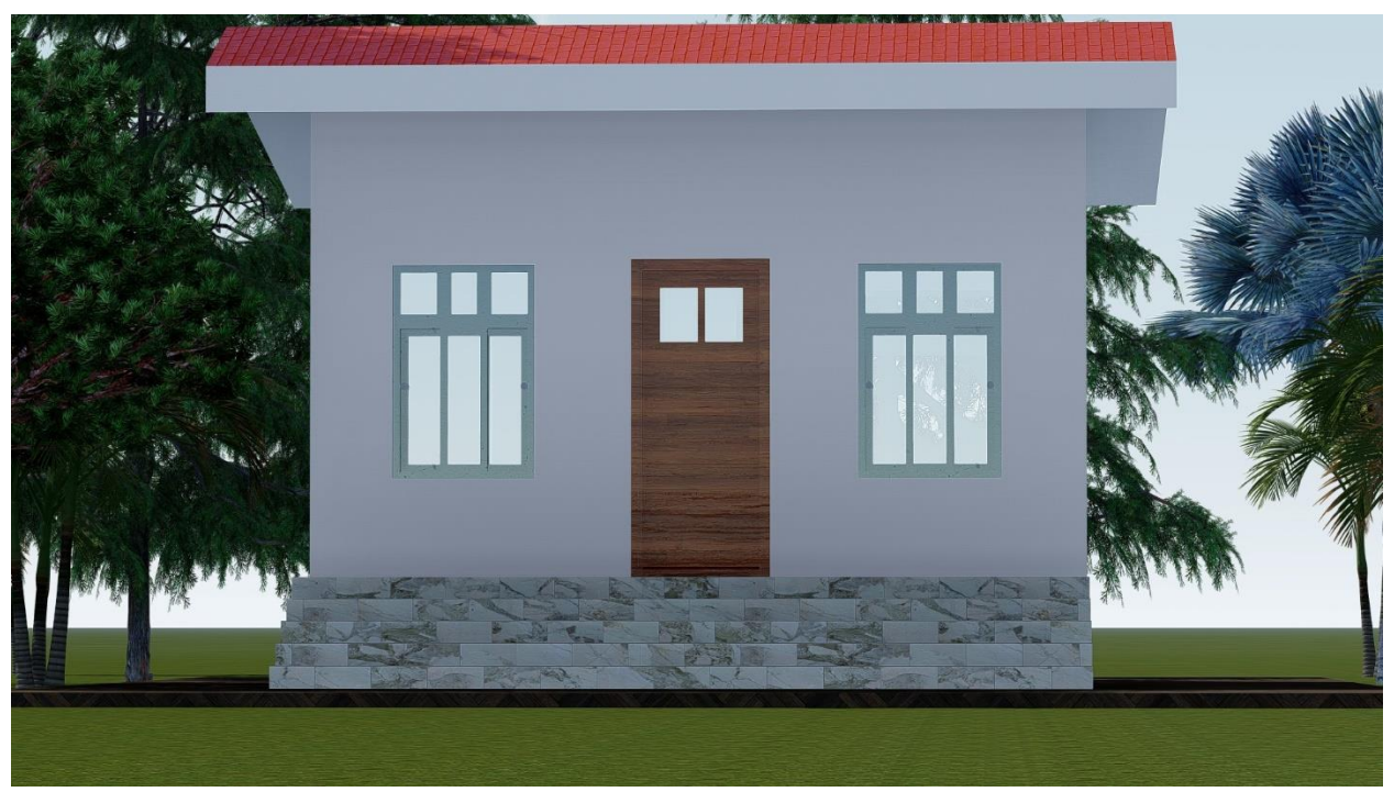
Figure 1 Kitchen